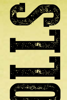
Extra toppings .99